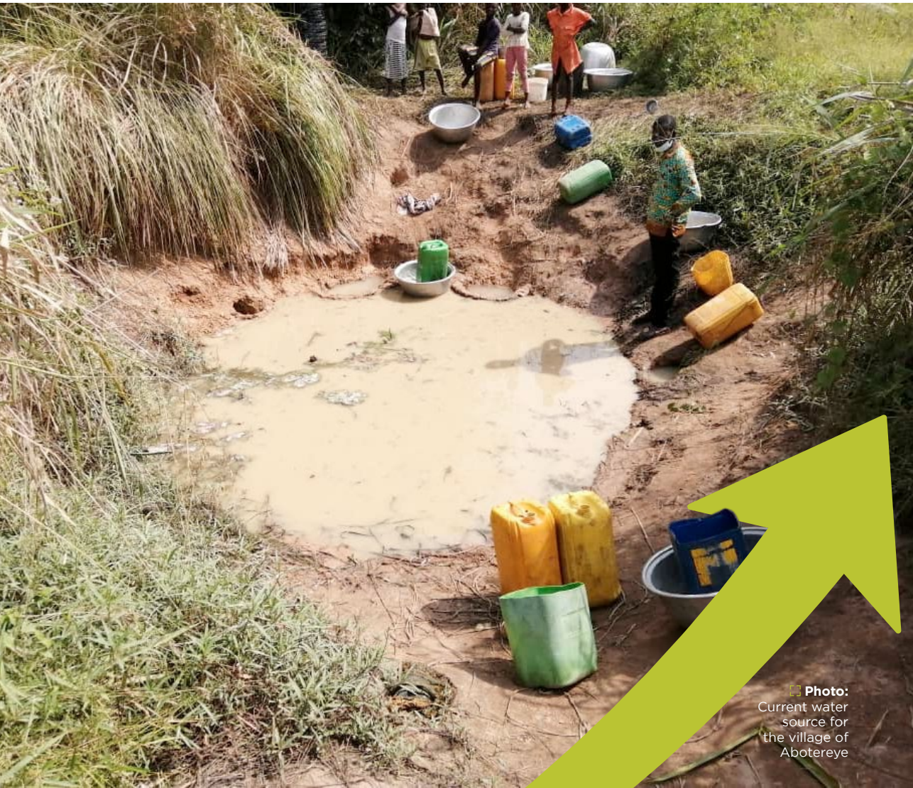
Photo: Current water source for the village of Abotereye